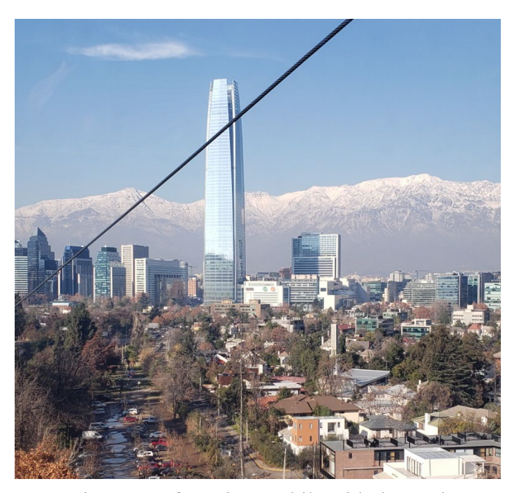
Cityscape of Santiago, Chile with the Andes Mountains in the background