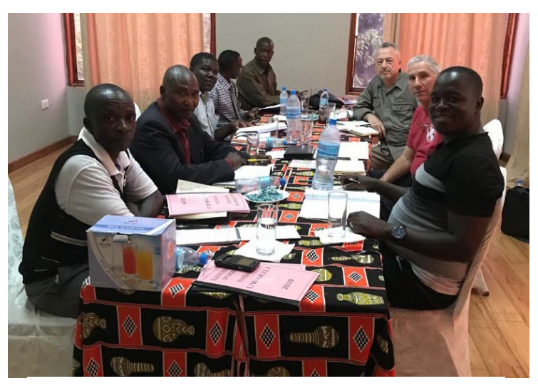
Tanzanian pastor group studying together